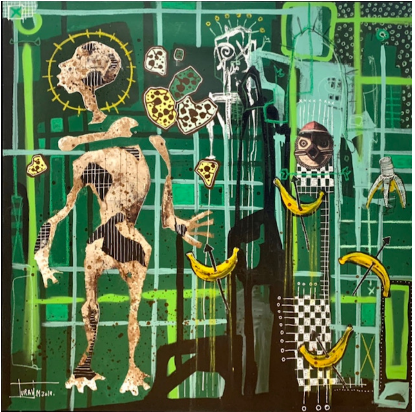
The Arrival of Settlers Mixed Media on canvas 150cm * 150cm 2019