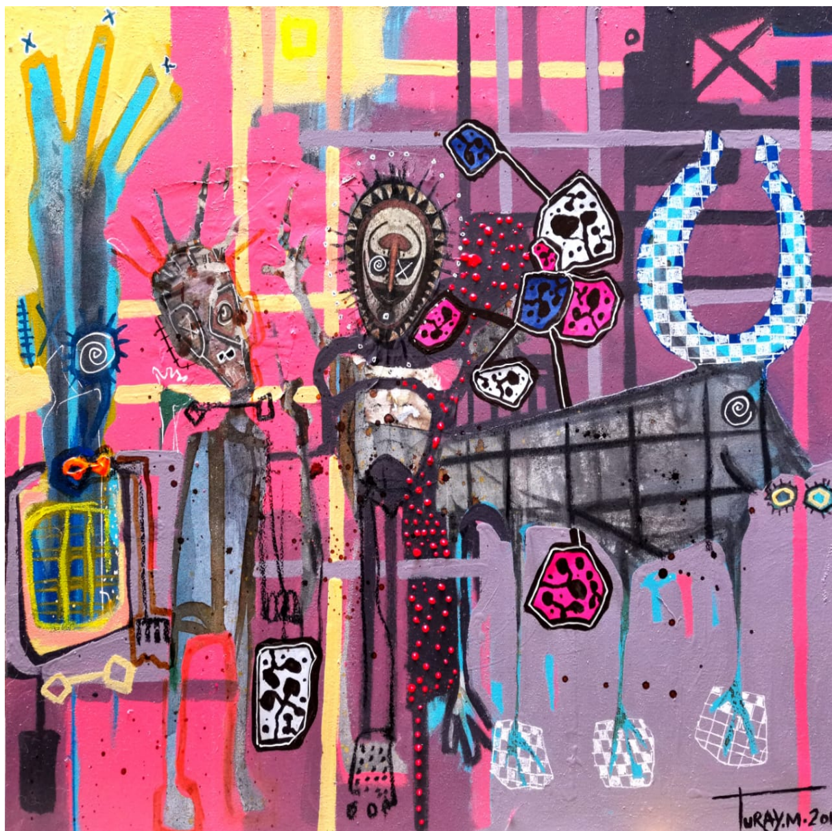
Shaman Mixed Media on canvas 100cm * 90cm 2019