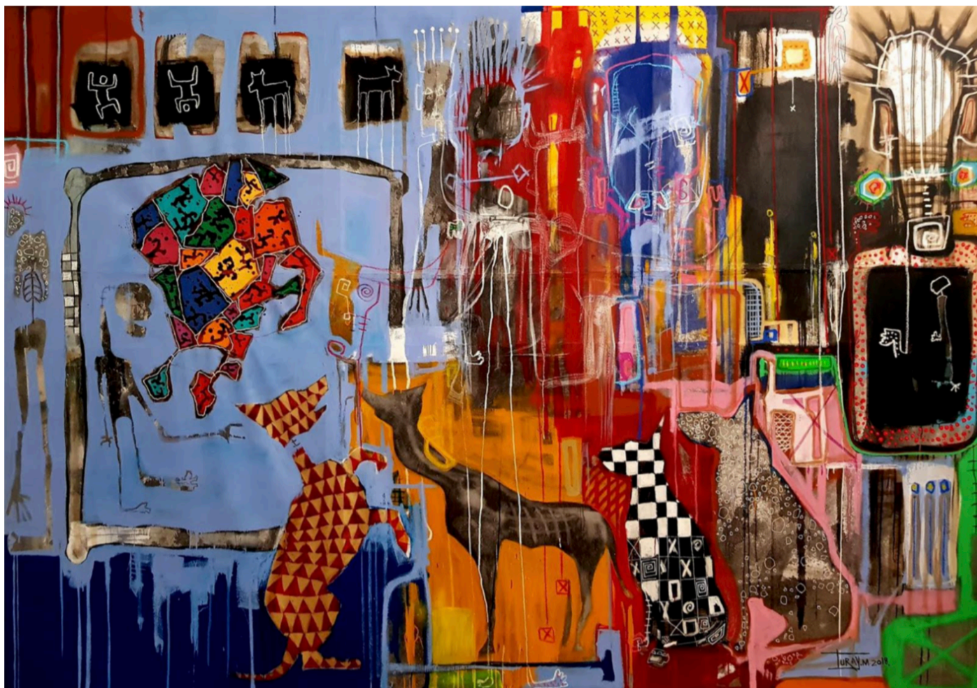
The Story Teller Mixed Media on canvas 342cm * 244cm 2019