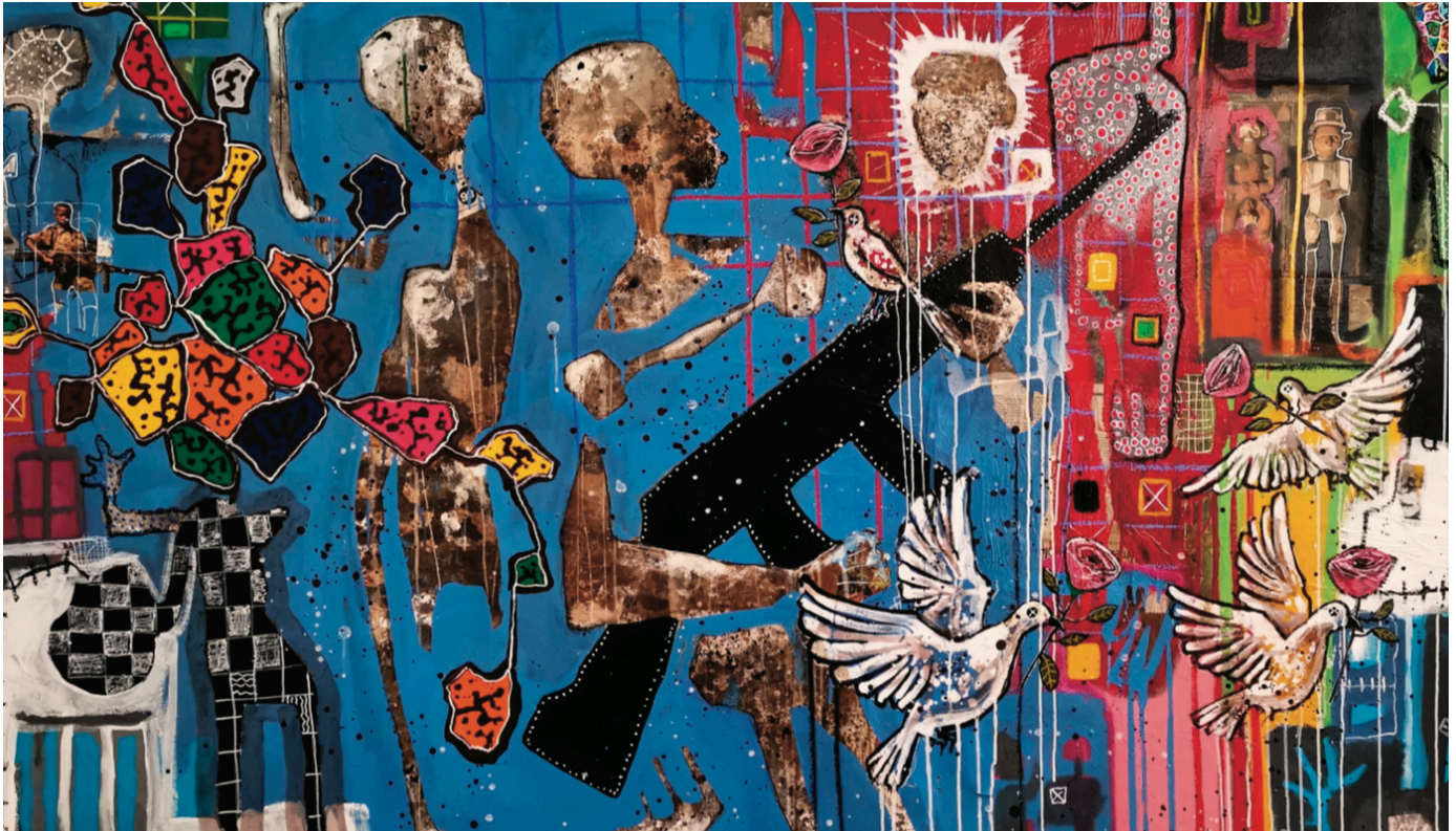
Mederic TURAY – Enfants Soldats (1/3) , 2019 Acrylique. 300 x 200 cm (détail)

DROUOT et FONDATION INVISIBLE BORDERS présentent